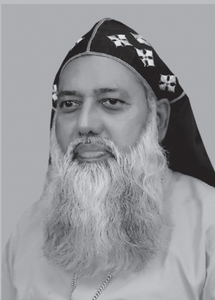
His Beatitude Moran Mor Cyril Baselios Catholicos Patron 1995-2007 First Catholicos