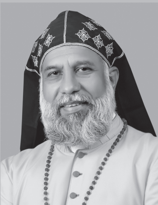
His Beatitude Moran Mor Baselios Cardinal Cleemis Catholicos Major Archbishop of Trivandrum & Patron